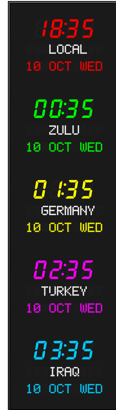
Model 3073H - 2.5" time, 1.2" zone labels, 1.2" date, 5 zones